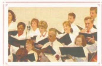
The Mission Bend UMC Choir

The music program is under the guidance of our Music Director with the support of numerous staff, volunteers and assistants. Our worship ministries also include our ushers and greeters, who do a wonderful ministry of welcoming members and guests into our worship services, and a drama ministry, which brings energy and creativity to our worship experience. The amount needed for total support of the worship ministries in 2008 is $394,465.