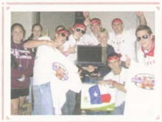
Our UMYF Group won first place AND a new laptop for the church in the Amazing Bible Race at Youth 2007

Through the Mission Bend Christian Academy we continue to shape the lives of children and families in our congregation and community with a Christian worldview. We provide a Christ-centered, academically accelerated program that develops good character, strong moral values, and love for learning. The total amount needed for the support of our discipleship, fellowship, youth, and children ministries for 2008 is $318,959.