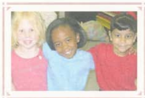
Our Academy offers a Christian based education to the children in our community