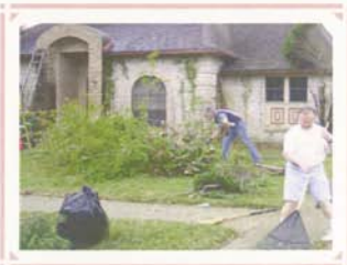
Helping those less fortunate in our community

More than 600 families have been blessed to have a mosquito net that keeps mosquitoes from biting during the night and spreading the killer disease.