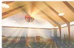
Mission Bend UMC Sanctuary

Go to the people of all nations and make them my disciples. Baptizing them in the name of the Father, the Son, and the Holy Spirit, and teach them to do everything I have told you.